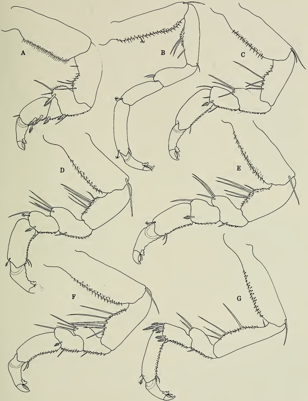
Fig. 2. Cymodocella algoense : A-G, Pereopods 1-7 respectively.